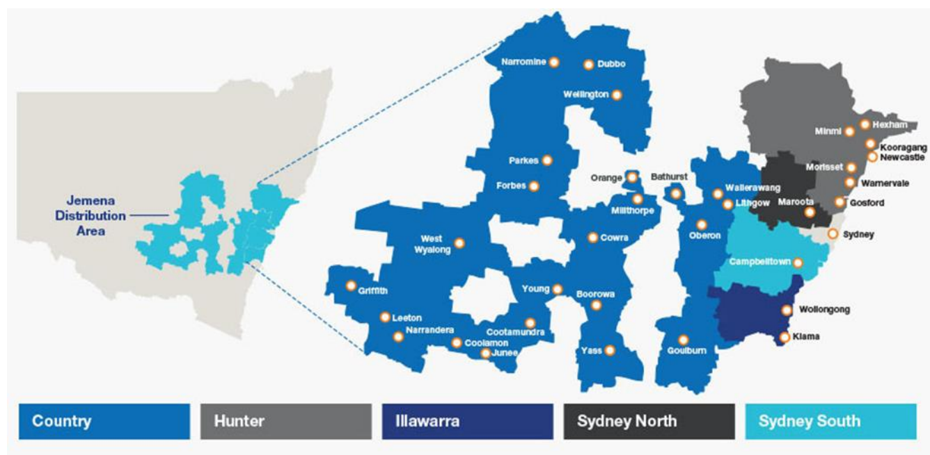
Figure 1 JGN's Distribution Network

JGN operates Australia's largest gas distribution network (the JGN Network). The JGN Network is over 25,000km in length and distributes gas to over 1.5 million residential, business and industrial sites in Sydney, Newcastle, the Central Coast and Wollongong, as well to customers in more than 20 regional centres, including in the Central West, Central Tablelands, South Western, Southern Tablelands, Riverina and Southern Highlands regions of NSW. Figure 1 shows the footprint of the JGN Network.